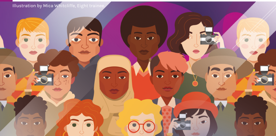
Illustration by Mica Whitcliffe, Eight trainee.